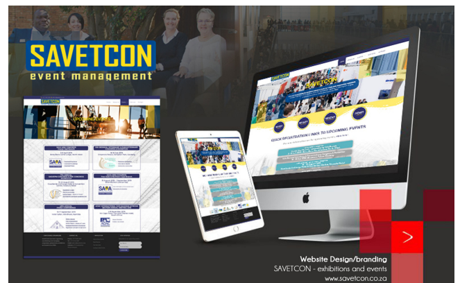
Savetcon, full-service, professional event management company.

We have used the services of Sourcebranding for the last 4 years, and have had excellent results through their efforts.