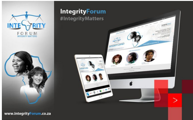
Africa First Integrity Forum Brand Positioning and Development.