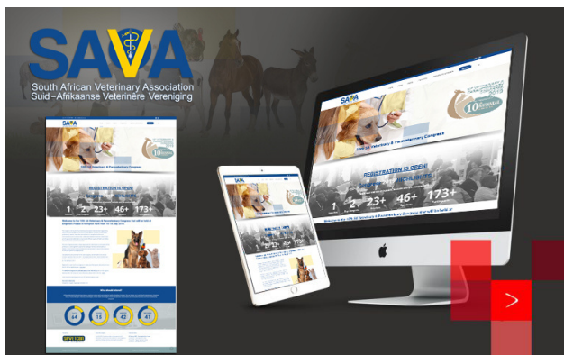
South African Veterinary Association (SAVA) Congress Web portal.