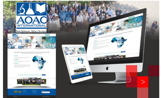
AOAC INTERNATIONAL Sub-Saharan Africa Section Project.