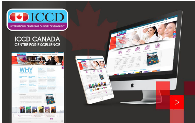
Canadian-based institution ICCD Course development Project.