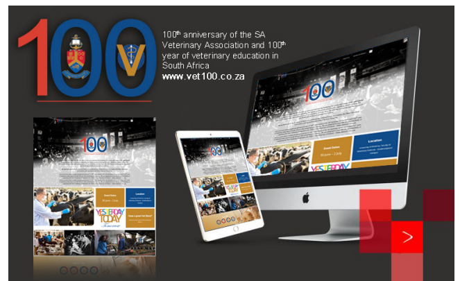
2020 - Twin Centenaries Congress (Vet100) web development project.

'We thank Sourcebranding for the creative and talented work they did for our Integrity Event and we highly recommend them, for their design, creativity, and timely execution.