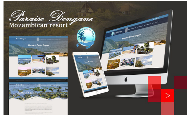
Paraisodongane a coastal based Resort, Inhambane, Mozambique.