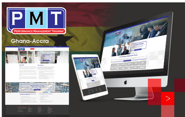
PMT Center, a higher training institution operating in Ghana.